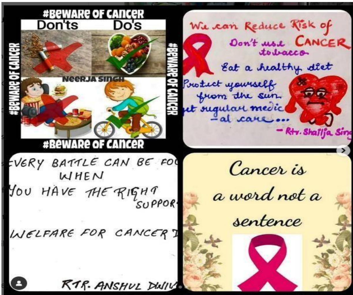
Glimpses of Beware of Cancer