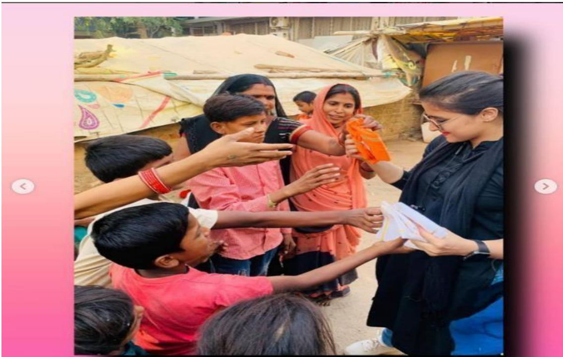
Glimpse of Daan Utsav