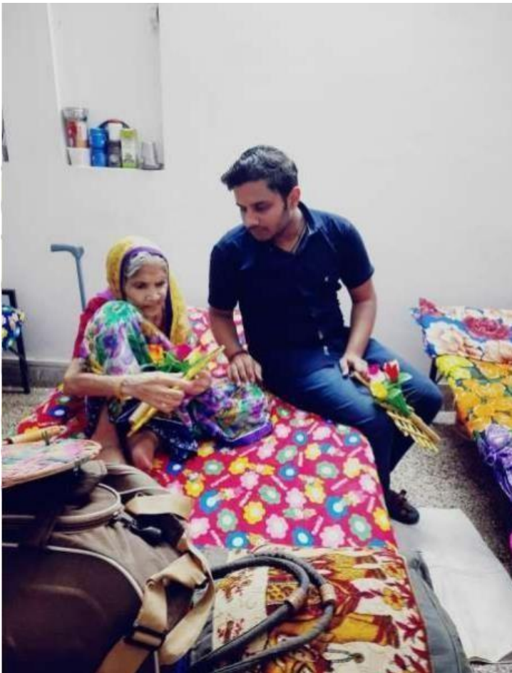
Glimpses of Old age home visit organized by Rotaract club of PIMR, Gwalior