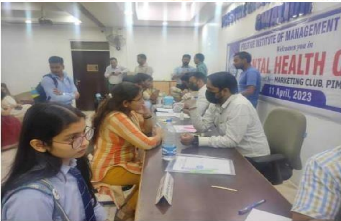
Glimpses of Dental Health camp