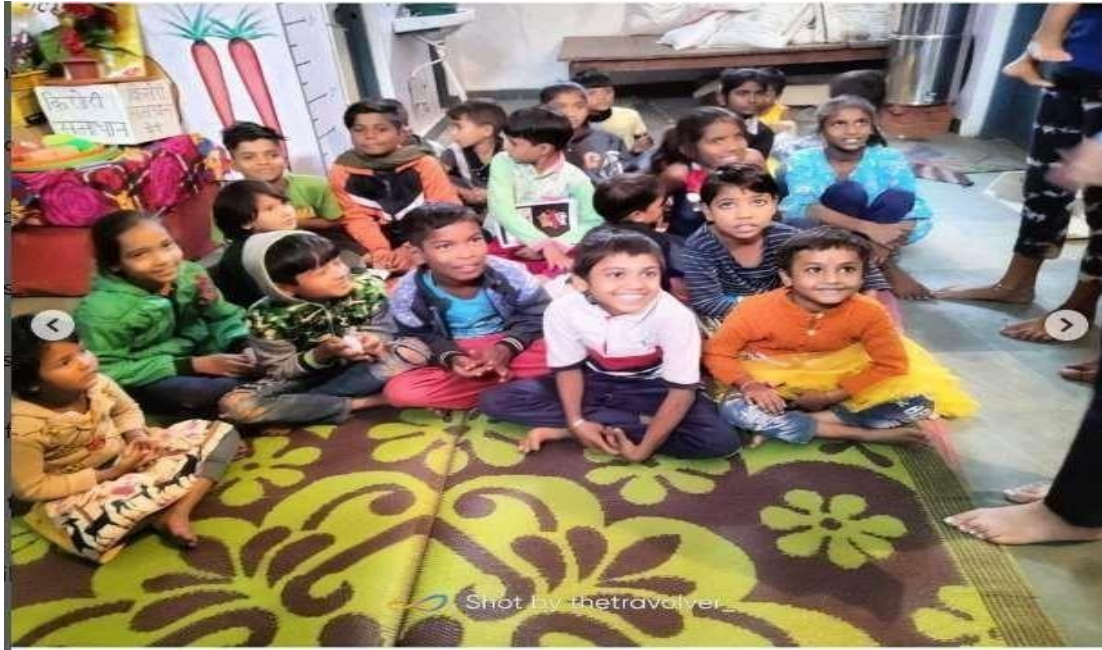
Glimpses of Meeting with kids of Anganwadi and Slum areas