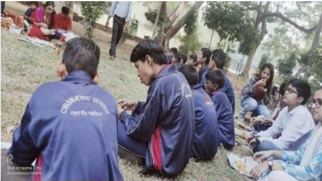
Glimpses of Zoo visit with CWSN Children