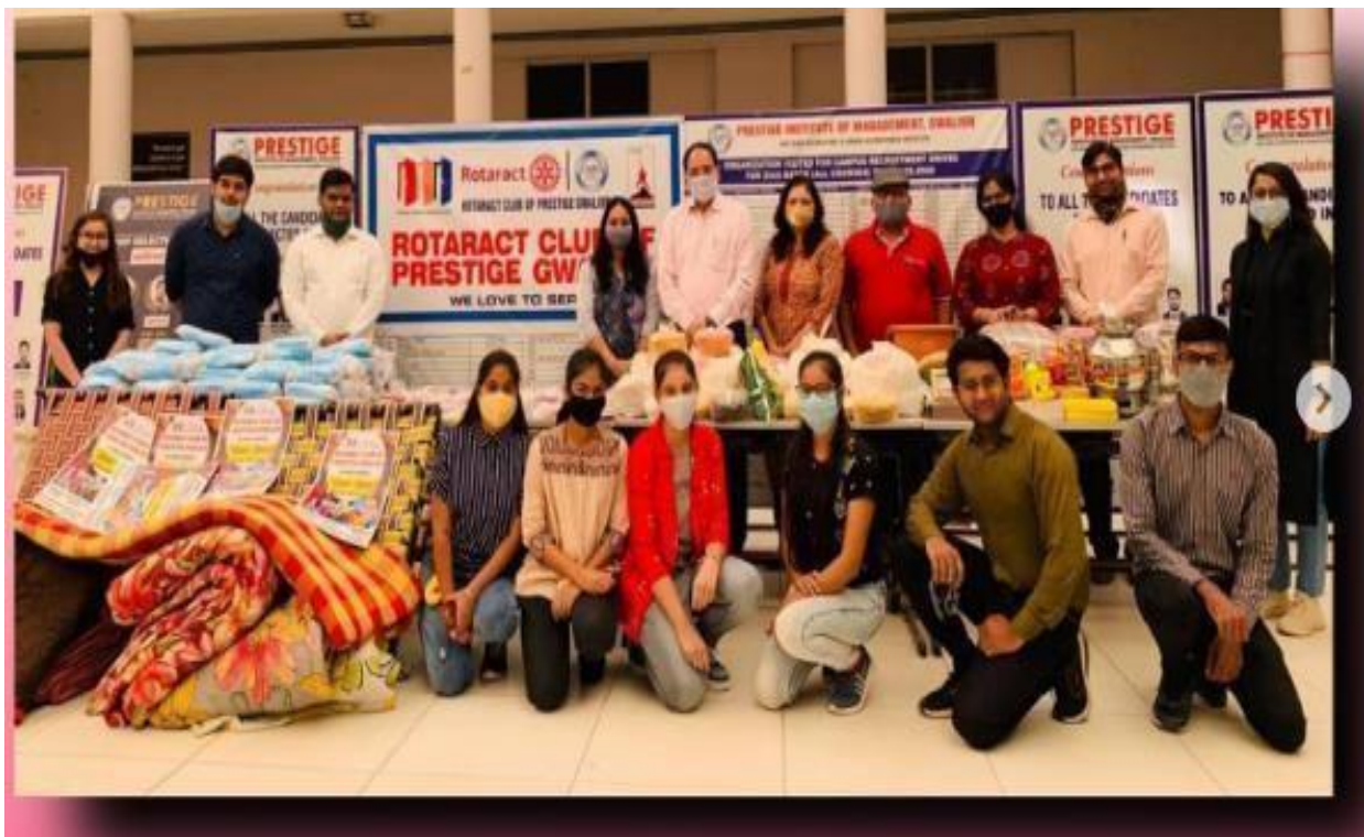
Glimpses of Daan Utsav