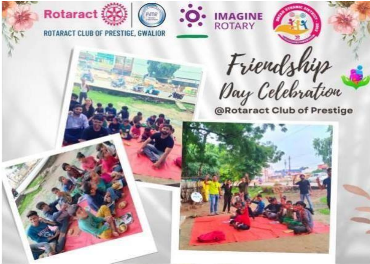
Glimpses of Slum area visit organized by Rotaract club of PIMR, Gwalior