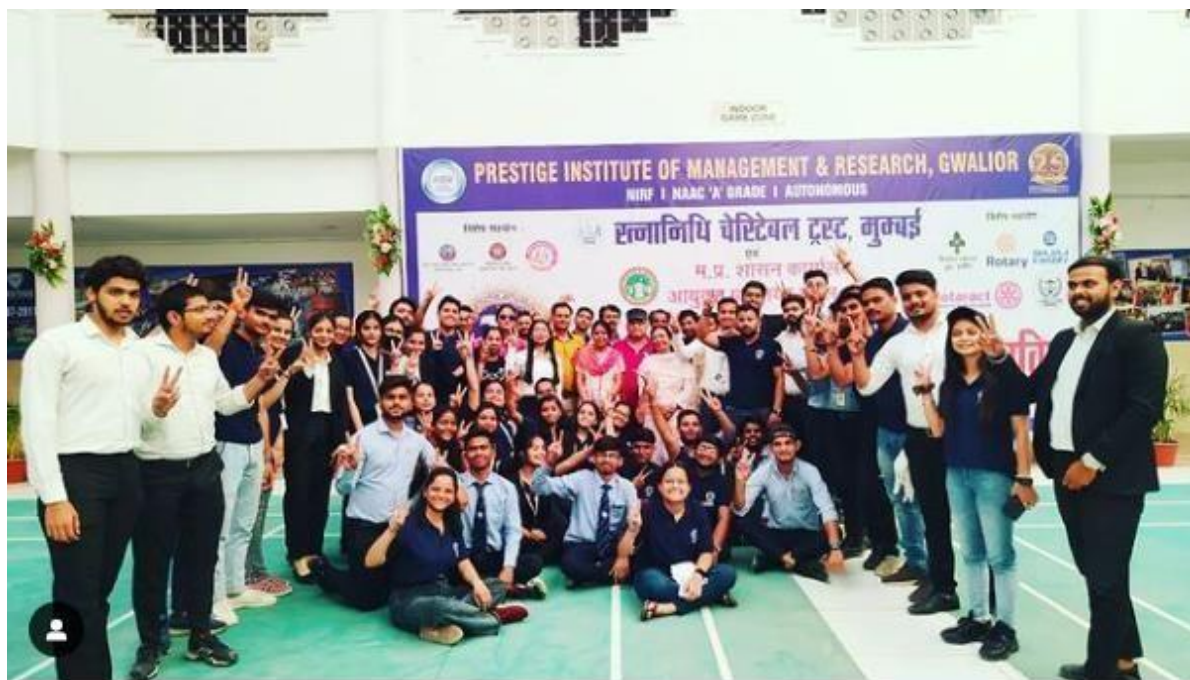
Glimpses of Artificial limb camp organized by Rotaract club of PIMR, Gwalior in association with Ratnanidhi Charitable trust