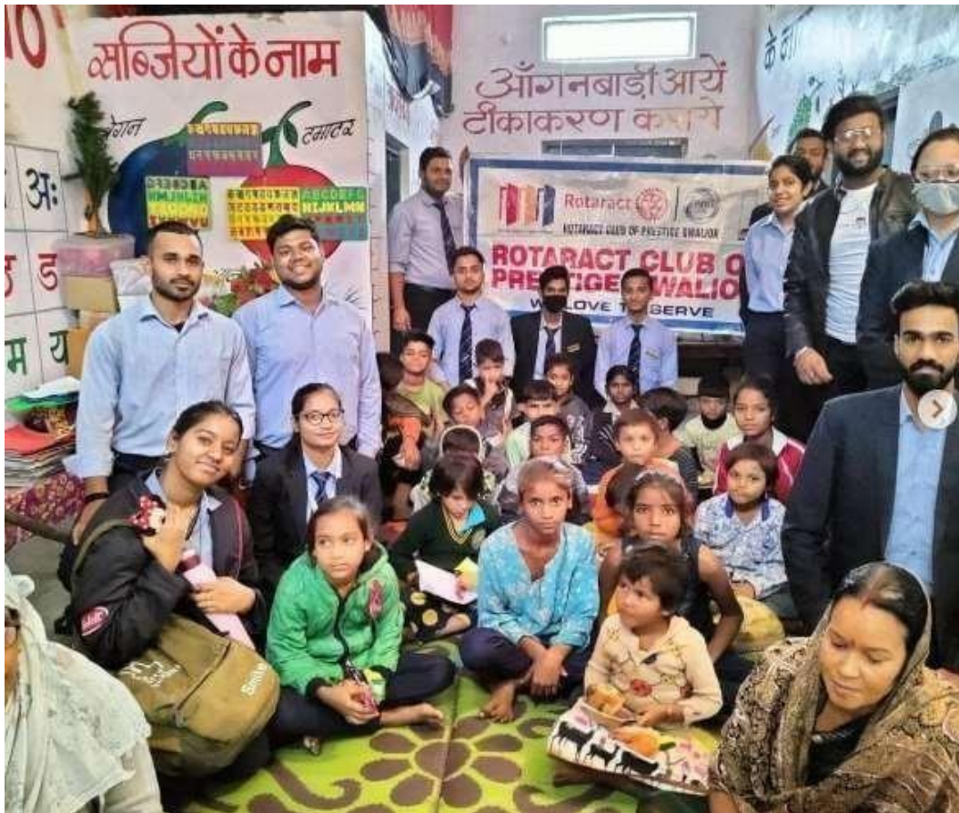
Glimpses of Meeting with kids of Anganwadi and Slum areas