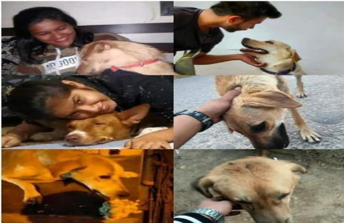
Glimpses of Feeding Stray dogs