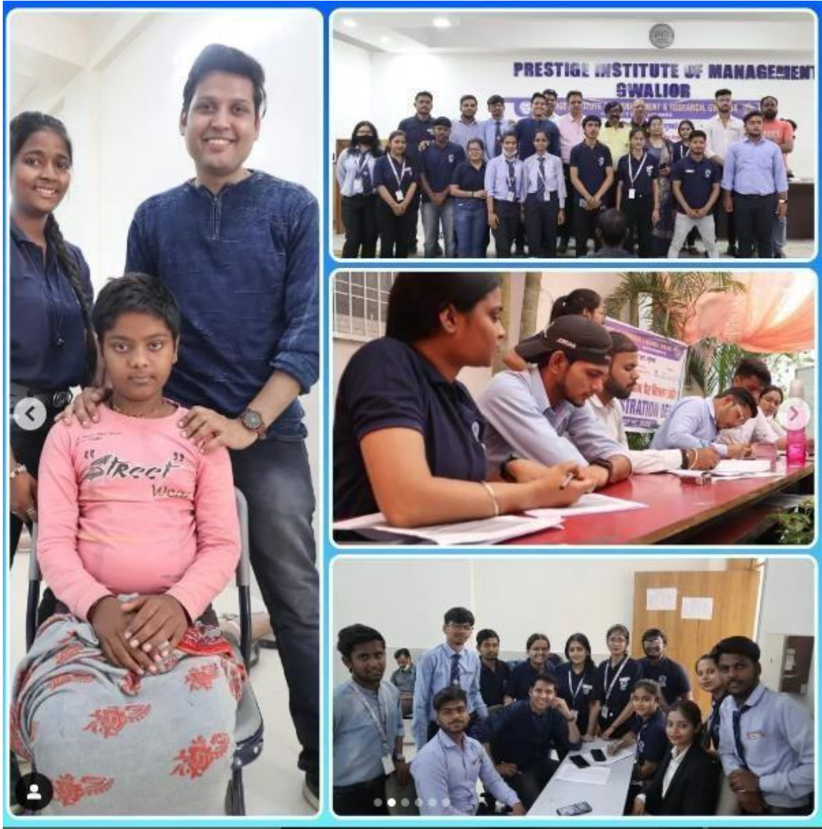
Glimpses of Artificial limb camp organized by Rotaract club of PIMR, Gwalior in association with Ratnanidhi Charitable trust