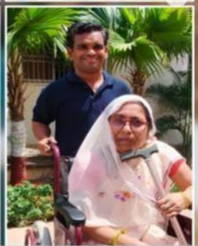
Glimpses of Artificial limb camp organized by Rotaract club of PIMR, Gwalior in association with Ratnanidhi Charitable trust