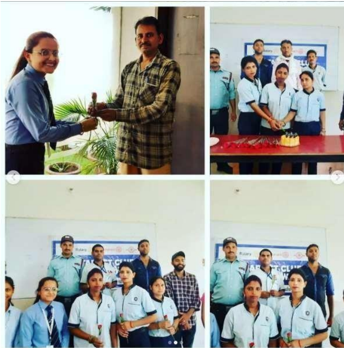
Glimpses of Recognition of workers