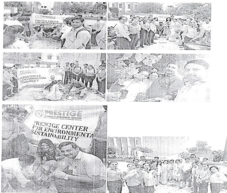
Glimpse of the event