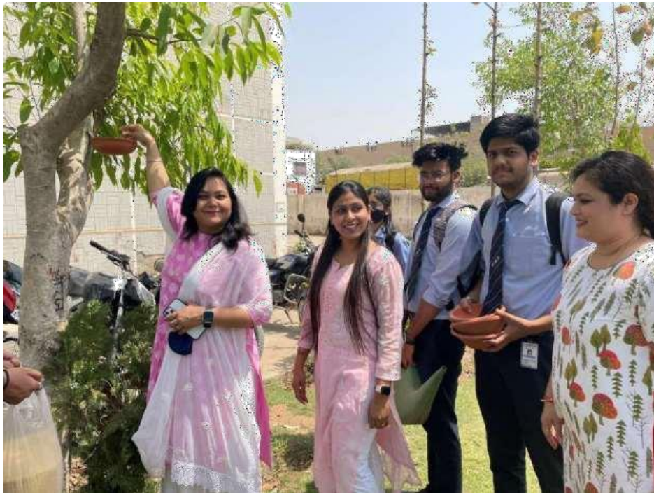
Glimpses of Dana Pani Event