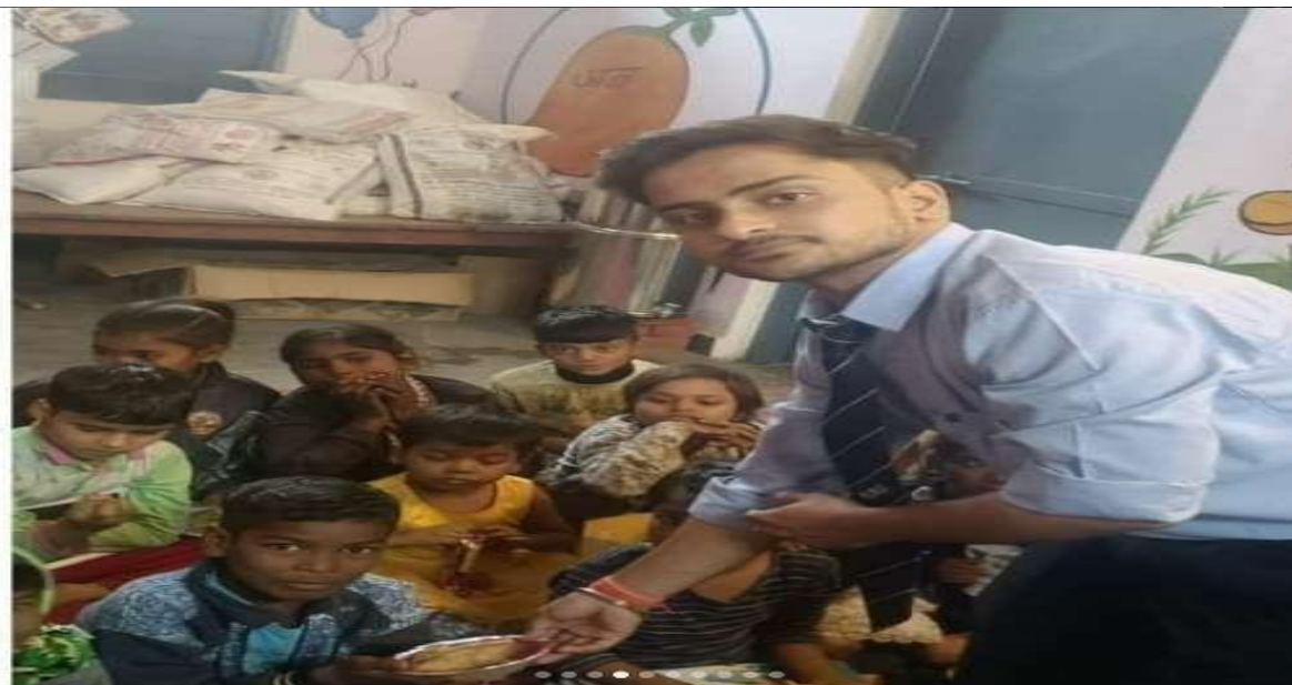
Glimpses of Meeting with kids of Anganwadi and Slum areas