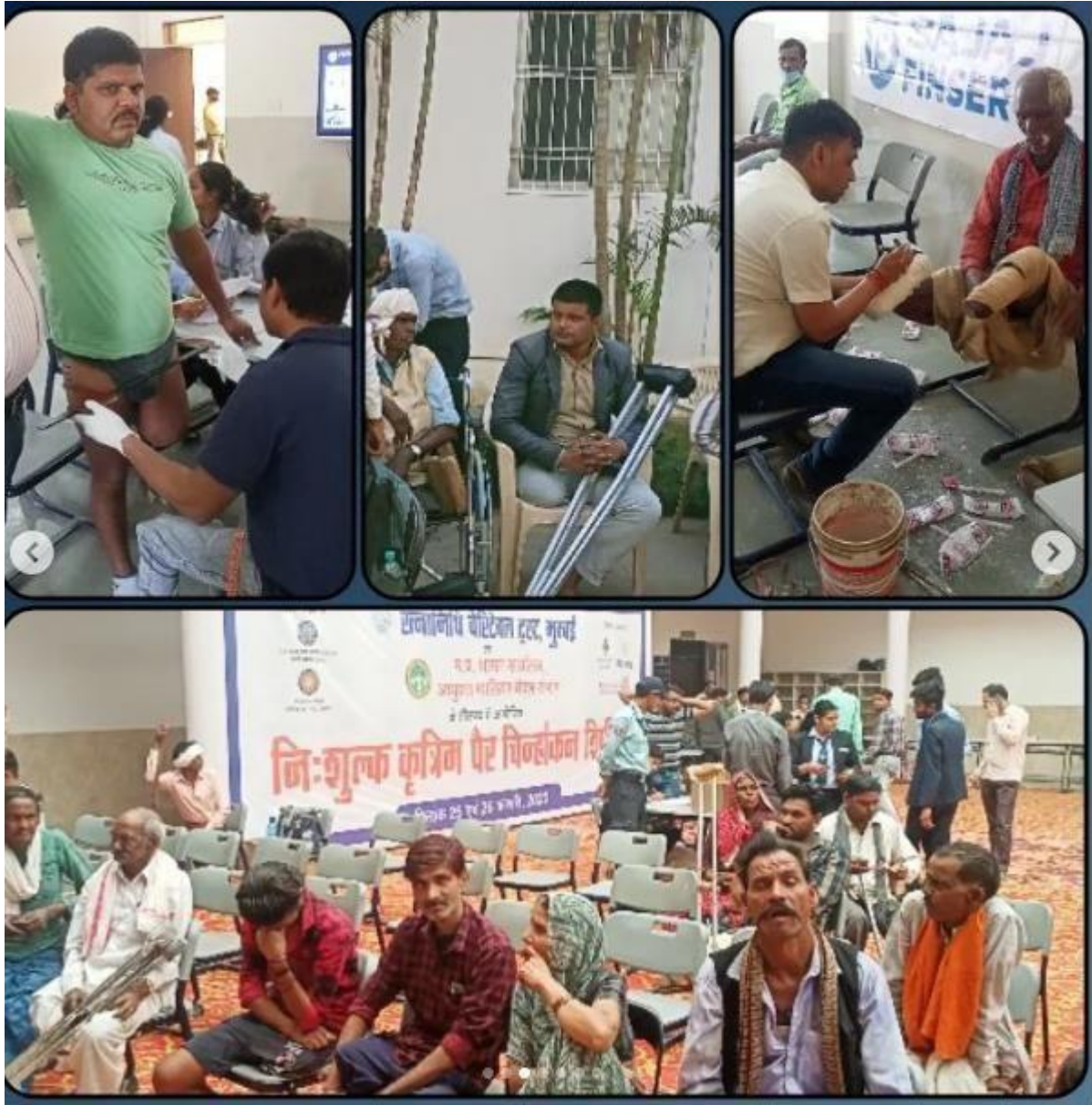
Glimpses of Artificial limb camp organized by Rotaract club of PIMR, Gwalior in association with Ratnanidhi Charitable trust