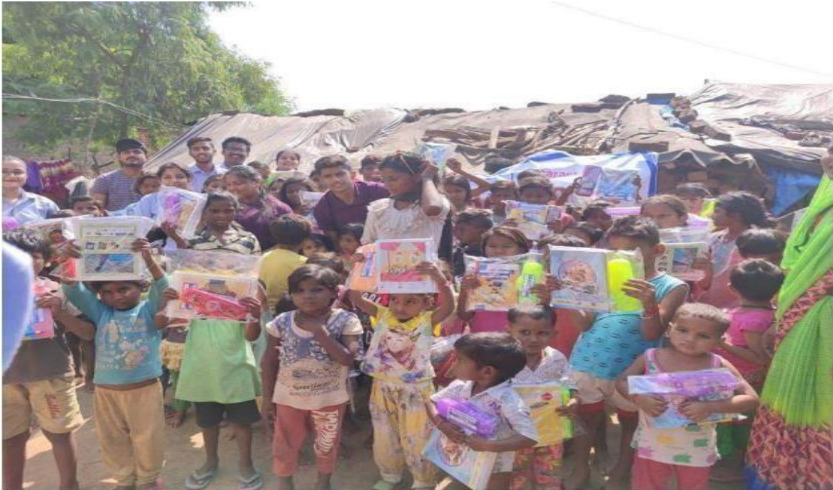
Glimpses of Sahyog Stationery Distribution Drive