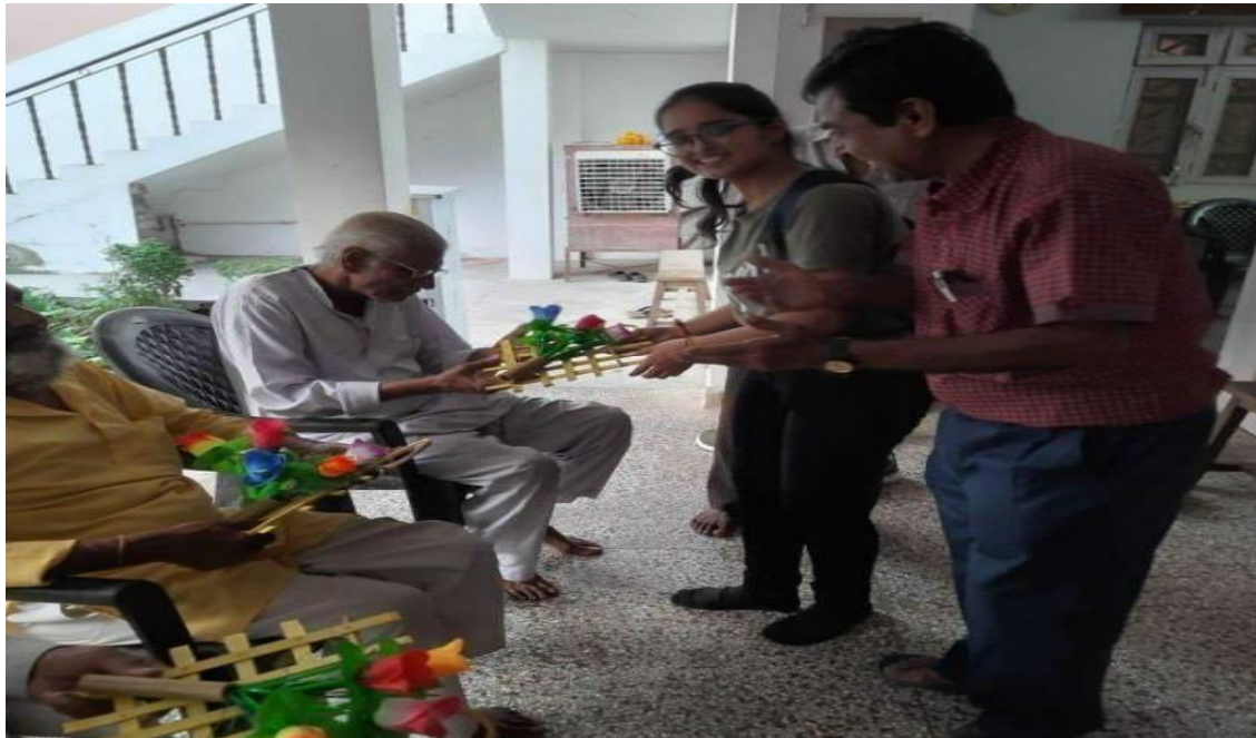
Glimpses of Old age home visit organized by Rotaract club of PIMR, Gwalior