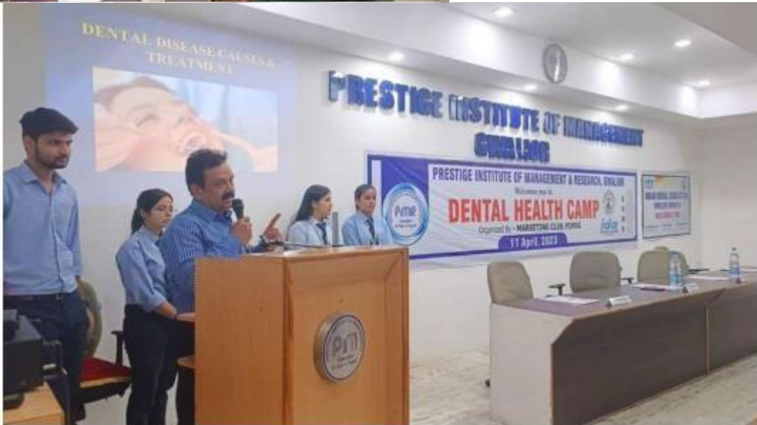
Glimpses of Dental Health camp