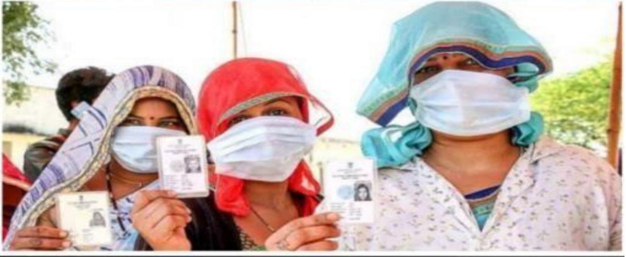
Glimpse of Mask Distribution Drive