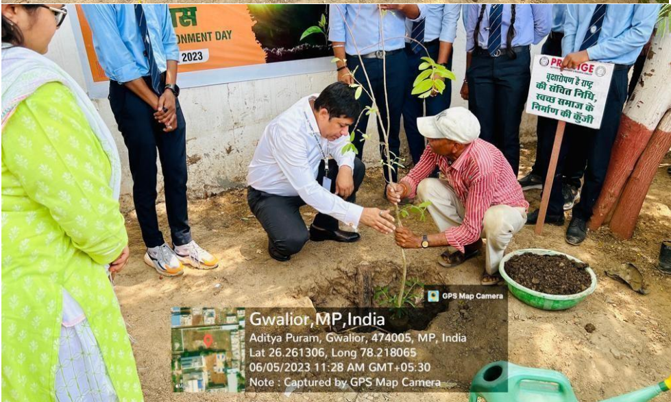
Glimpses of Plantation and Seed ball distribution