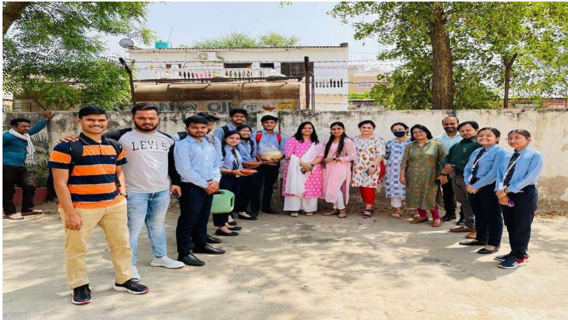
Glimpses of Dana Pani Event